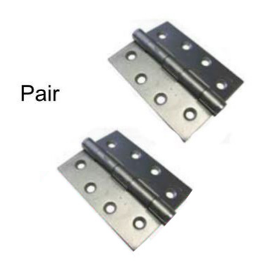
Butt Hinges Stainless steel Fixed Pin 2 Hinges