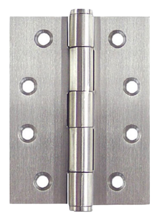
Pair - Steel Butt Hinges- Zinc Finished