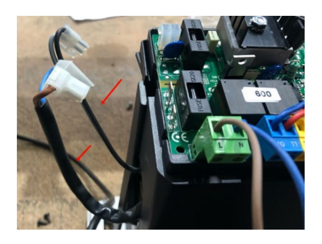
Step 5 Connect the wires like the photo below.